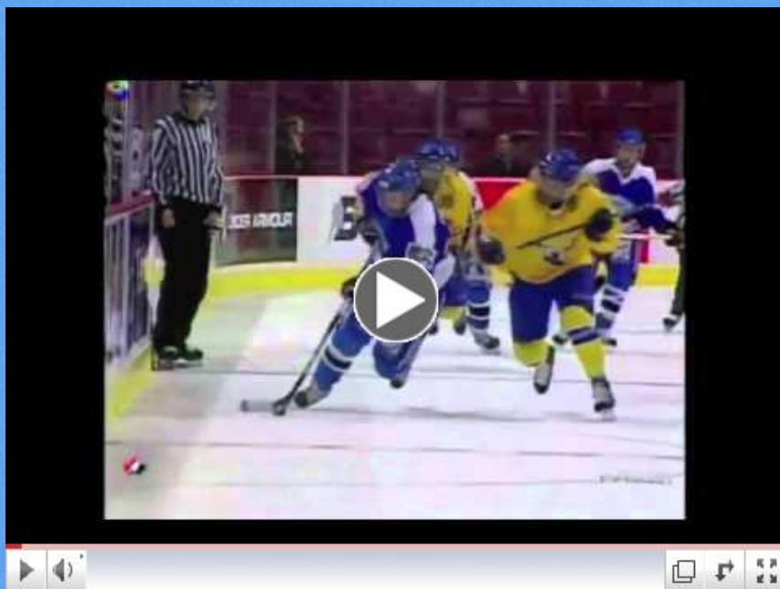
Examples of Legal & Illegal Body Contact

2011-13 Rulebook 2011-13 Playing Rules Casebook 2011-13 Rule Change Summary Major Penalty Reference Table - Adult Leagues Only